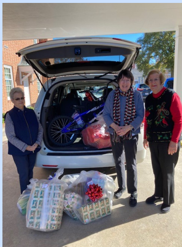
PW angels delivered toys to their Christmas family at My Sister's House on December 14.