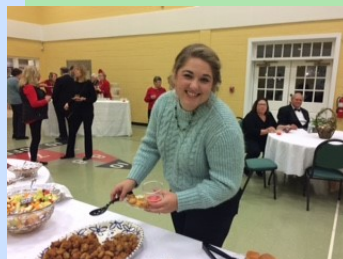
Community Concert Reception