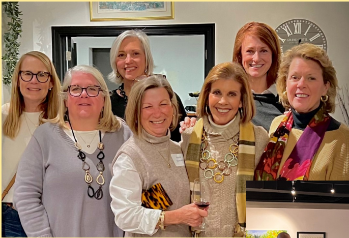
FPC Wine Tasting at Bin & Barrel